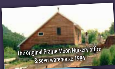
The original Prairie Moon Nursery office & seed warehouse 1986