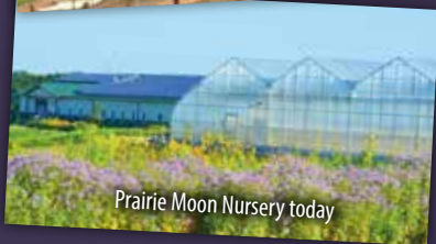
Prairie Moon Nursery today